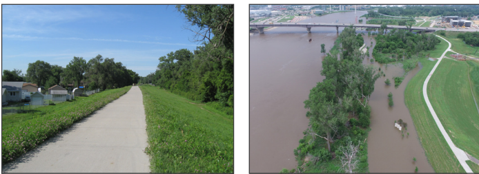
Levees decrease the frequency of flooding on neighboring properties.